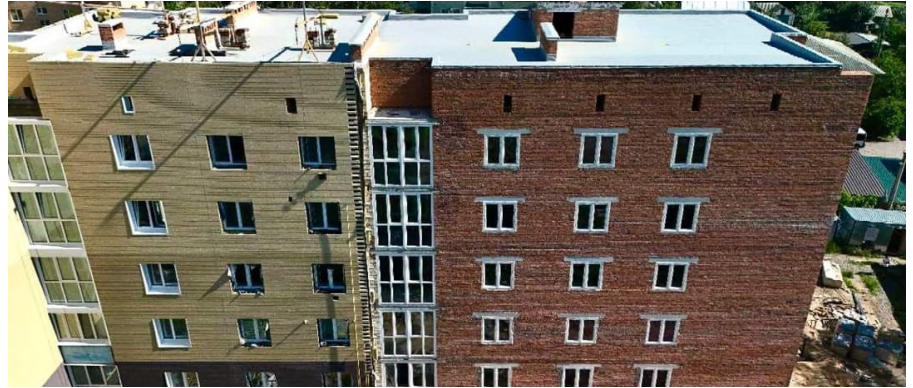
Restoring a residential building in Makariv, the Kyiv region