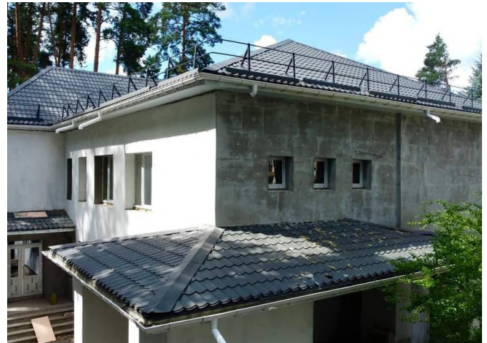
Restoring the kindergarten “Forest Fairy Tale” in Honcharivske, the Chernihiv region

*As of June 28th, 2024, according to regional military administrations since February 24th, 2022