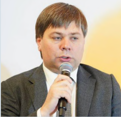
Vasyl SHKURAKOV, Acting Minister for Communities, Territories and Infrastructure Development of Ukraine:

The process of rapprochement with the EU will help overcome Ukraine's housing policy challenges. The instrument provides for improving national legislation in this area, which will further facilitate the attraction of funding, including from European funds. Adopting the draft law "On the Basic Principles of Housing Policy" is one of the conditions in the Ukraine Facility.