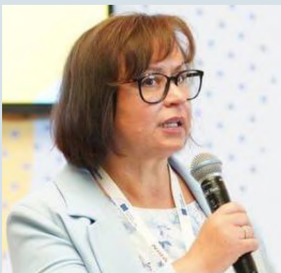
Natalia KOZLOVSKA, Deputy Minister for Communities, Territories and Infrastructure Development of Ukraine:

The systematic Russian shelling of civilian infrastructure, including multi-apartment buildings, has dramatically enhanced the need for housing for the Ukrainians. The EU is addressing this topic in different ways, both by providing support to reforms in the housing sector that are included in the Ukraine Plan of the Ukrainian Government and by offering guarantees and blended finance to investments financed by IFIs like EIB for the renovation of war-damaged buildings and construction of new affordable housing. The Ukrainian Government must strengthen the role of Homeowners Associations in the planning and implementing of these future projects, ensuring that the voices of individual homeowners are heard and prioritized.